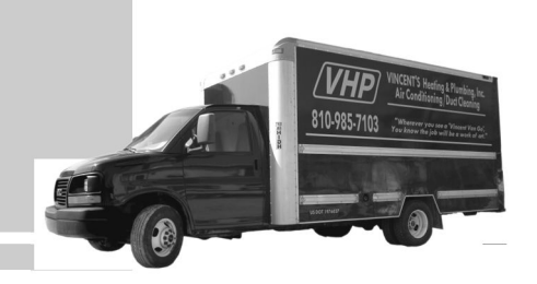
"Wherever you see a Vincent's Van Go' you know the job will be a work of art."