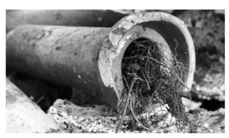
A removed section of broken crock containing tree roots .

Other types of piping can also break and allow the penetration of tree roots. We'll explore those next month.