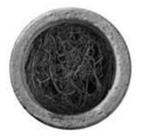
Root Clogged Pipe

Classified as a General Use Product by the EPA (EPA reg.# 68464-1), as oppose to Restricted Use, RootX® can be used in both sanitary and storm pipe without adversely affecting the environment